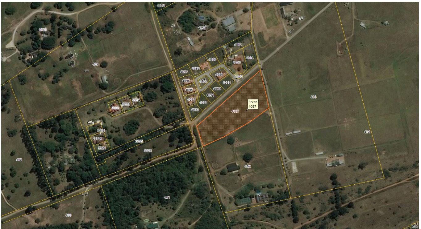
Figure 2: The Proposed Lovemore Group Housing Development outline, Heatherbank road, Theescombe, Port Elizabeth