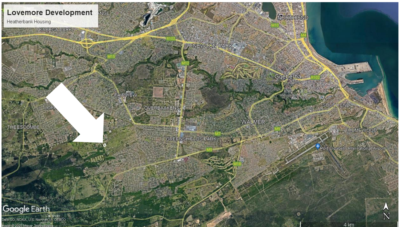
Figure 1: Location of the proposed new Lovemore Group housing development in Heatherbank, Port Elizabeth (Google Earth image).

The proposed new housing development and associated infrastructure will be located on a portion of Erf 4087 along Heatherbank Road in Theescombe, Port Elizabeth. The land is currently utilized as part of an equestrian ranch.